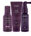
invati advanced™ mini system rich exfoliating shampoo rich (50 ml) thickening conditioner (40 ml) scalp revitalizer (30 ml)