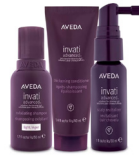
invati advanced™ mini system light exfoliating shampoo light (50 ml) thickening conditioner (40 ml) scalp revitalizer (30 ml)